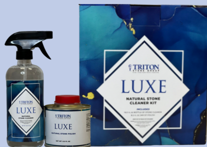
Luxe Natural Stone Cleaner Kit

SPECIALLY FORMULATED TO CLEAN, SHINE & PROTECT CRESCENT QUARTZ SURFACES!